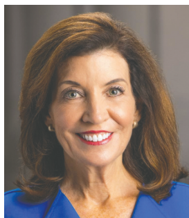
New York Governor Kathy Hochul