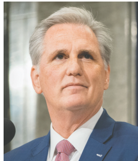
Congressman Kevin McCarthy